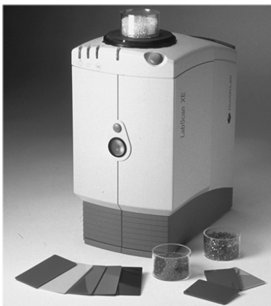
LabScan XE Measuring Pellets