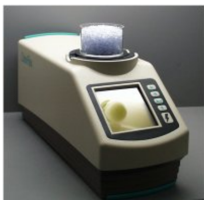
Cup of pellets on ColorFlex 45/0

Plastic pellets and similar items like rice and sugar must be measured in a batch rather than individually, which makes them more fluid than solid. They would either be placed in a glass sample cup and measured using a 45°/0° or 0°/45° instrument such as the LabScan XE, ColorFlex 45/0, or D25A (preferred) or placed in a glass transmission cell and measured at the reflectance port of a diffuse/8° instrument such as the ColorQuest XE, UltraScan PRO, or UltraScan VIS.