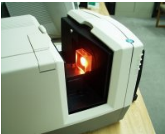
Transparent liquid in transmission

Transparent, translucent, and opaque liquids must all be placed in a container for measurement. Transparent samples would normally be placed in a glass transmission cell and measured in the transmission compartment of a diffuse/8° instrument such as the ColorQuest XE, ColorQuest XT, UltraScan PRO, or UltraScan VIS. Translucent and opaque liquids would either be placed in a glass sample cup and measured using a 45°/0° or 0°/45° instrument such as the LabScan XE, ColorFlex 45/0, or D25A (preferred) or placed in a glass transmission cell and measured at the reflectance port of a diffuse/8° instrument such as the ColorQuest XE, UltraScan PRO, or UltraScan VIS.