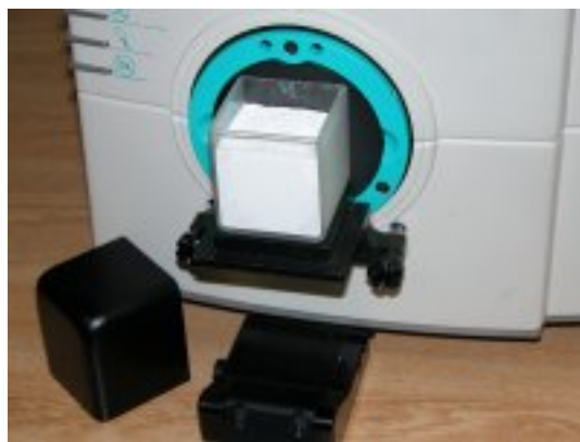
Cell of powder on diffuse/8° instrument