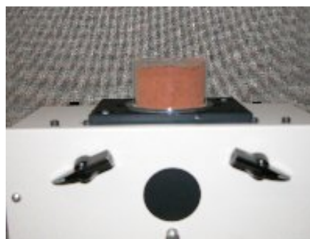
Cup of powder on D25A