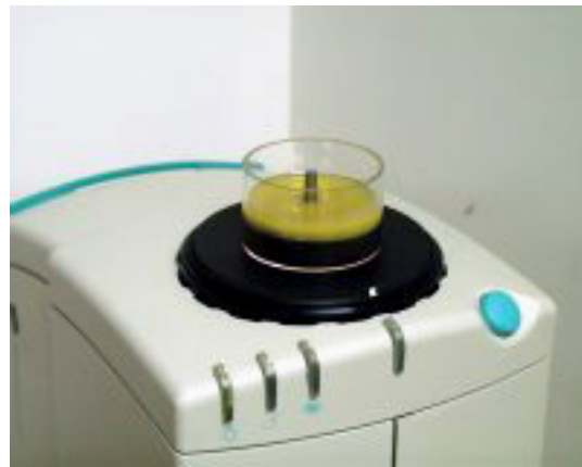
Translucent liquid on LabScan XE