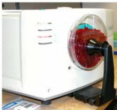
Large particulates in Petri dish on diffuse/8° instrument