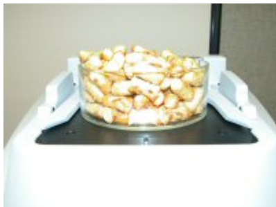
Large particulates in sample dish on the D25LT