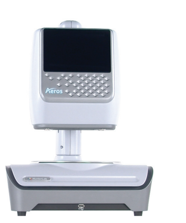
Aeros® Reflectance Spectrophotometer