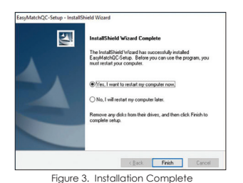
8. For the CD: The CD can now be removed.

installation is finished, select the button next to Yes , I want to restart my computer now and then Finish to restart the computer and log back in.